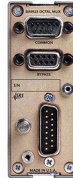
SIM925 rear panel