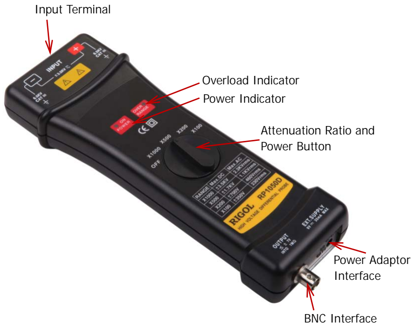
Figure 2 RP1050D High Voltage Differential Probe