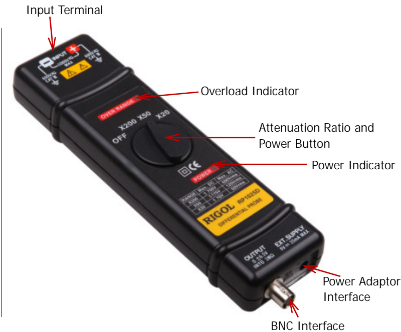
Figure 1 RP1025D High Voltage Differential Probe