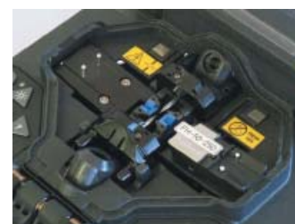
Top view of FSM-17S-FH

Specifications and descriptions are subject to change without prior notice.