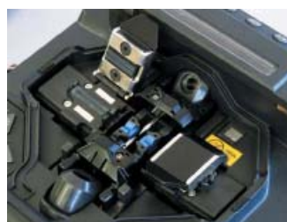
Top view of FSM-17S